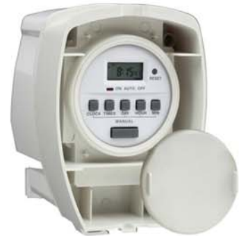
Squirt's enclosed back and rubber boot protects timer from tampering and the environment