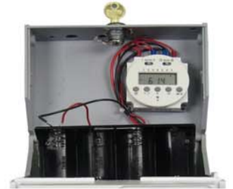
Drain Chief's battery pack nests inside locking, splash resistant cabinet